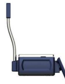
12.1" OD / 7" CD display