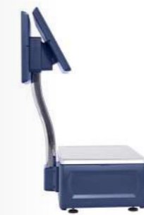
12.1" OD / 12.1" CD display