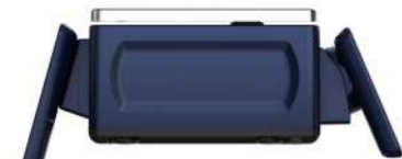
12.1" OD / 12.1" CD display