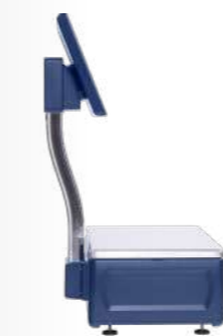
12.1" OD / 7" CD display