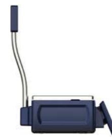
10.1" OD / 7" CD display