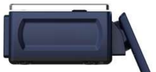
12.1" OD / 7" CD display