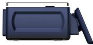
10.1" OD / 7" CD display