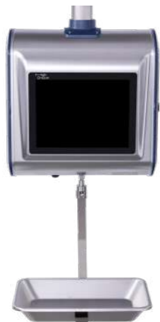
12.1" OD / 12.1" CD display with label printer