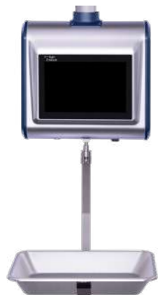
10.1" OD / 10.1" CD display with receipt printer