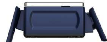
10.1" OD / 10.1" CD display